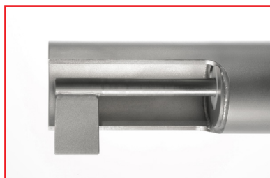
Paddle and shaft welded