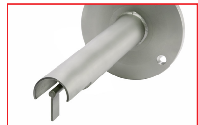
Robust, integrated protective cover