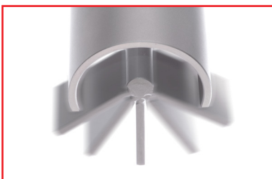
Swivelling range of 120 degrees